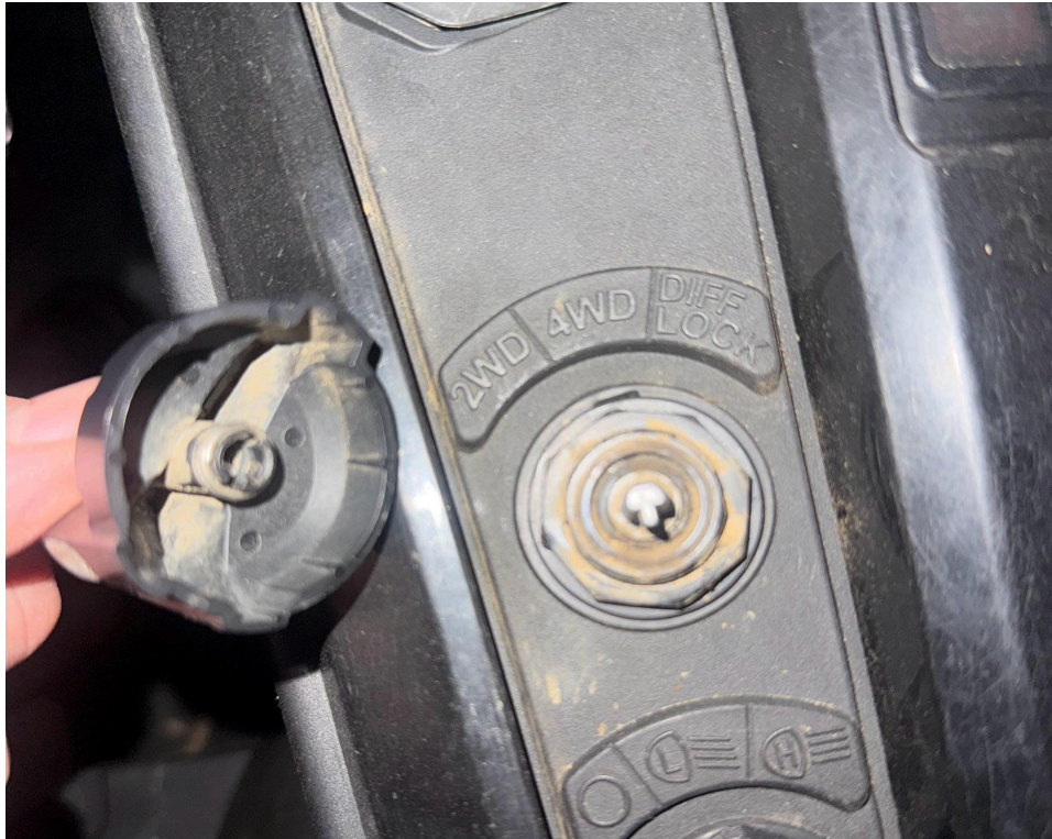
Bottom of OEM Knob